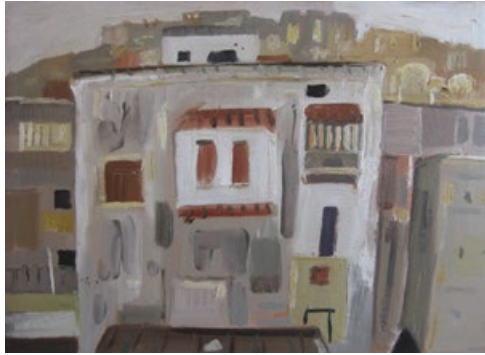
Little village , 2015, oil on board, 25 x 31cm