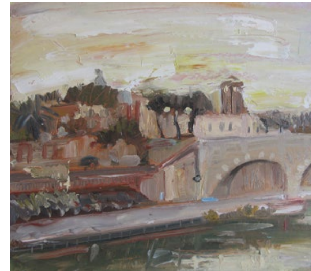
Sunrise, Tiber River, Trastevere, 2015, oil on board, 32 x 36cm