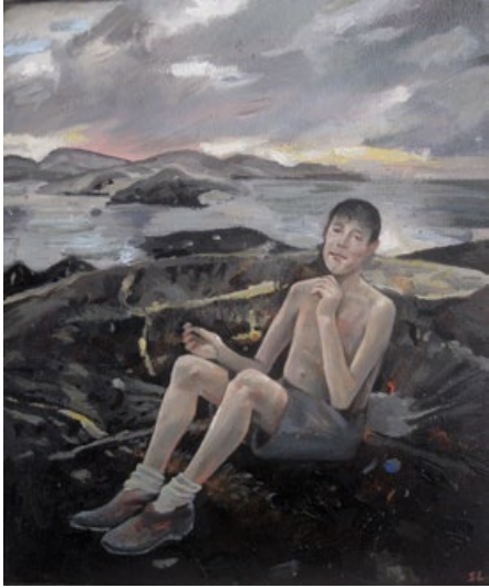
Aeolian figure study , 2016, oil on canvas, 28 x 20cm