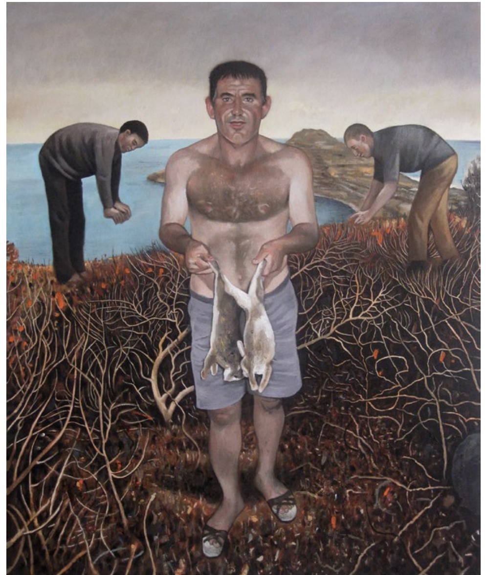
Hunter, Filicudi, 2016, oil on canvas, 110 x 90cm