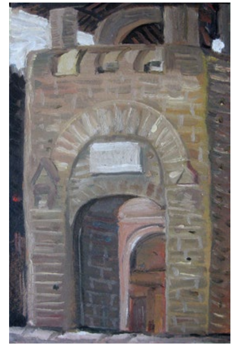
Tower at Florence, 2015, oil on board, 35 x 23cm