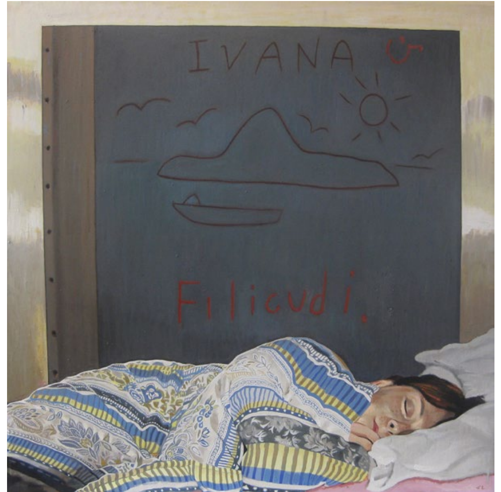
Dreaming of Filicudi , 2016, oil on canvas, 100 x 100cm