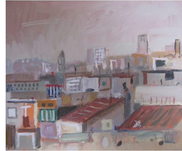
Rooftop study II, Naples, 2015, oil on board, 30 x 32cm