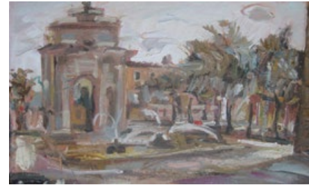
Fountain and tower, Florence, 2015, oil on board, 22 x 36cm