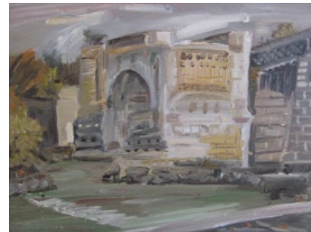
Broken bridge, Tiber River, Rome, 2015, oil on board, 28 x 37cm