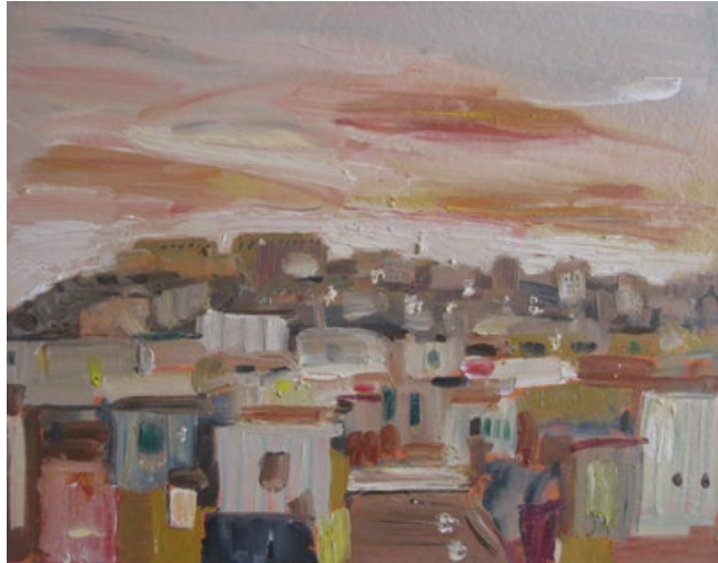
Sunset study certosa, Naples, 2015, oil on board, 30 x 38cm