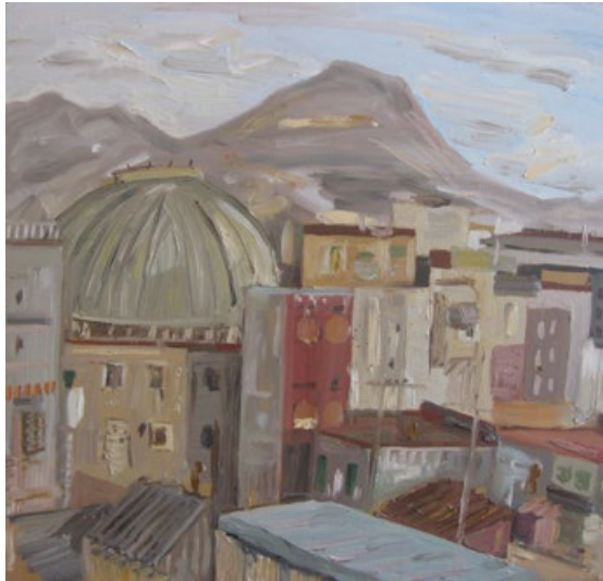
Vesuvius and dome, Naples, 2015, oil on board, 38 x 41cm