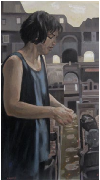
Vaults of insight – Lucia, 2016, oil on board, 60 x 37cm