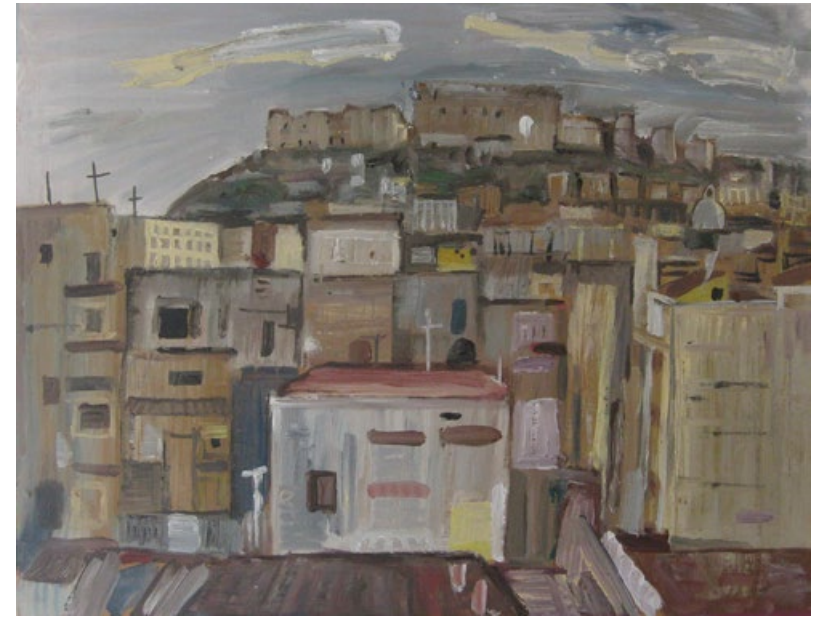
City study Naples , 2015, oil on board, 40 x 52cm