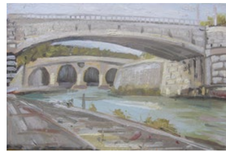
Tiber bridges, Rome, 2015, oil on board, 17 x 26cm