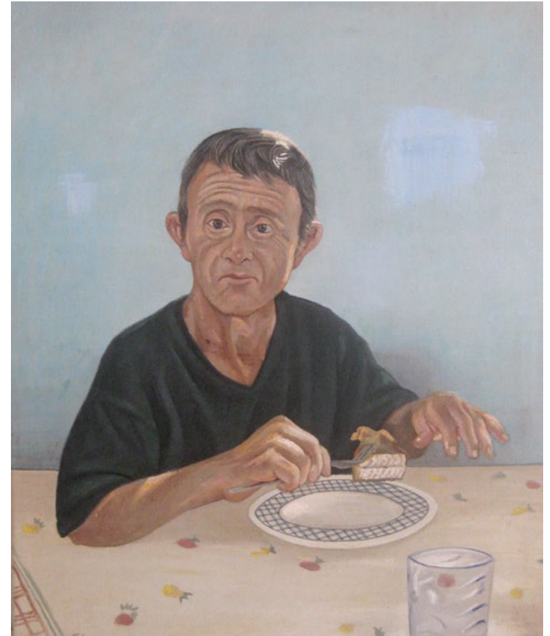
Stranger at the table, 2016, oil on canvas, 70 x 60cm