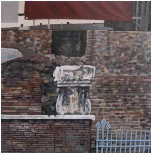
Street structures, Rome, 2016, oil on canvas, 45 x 45cm