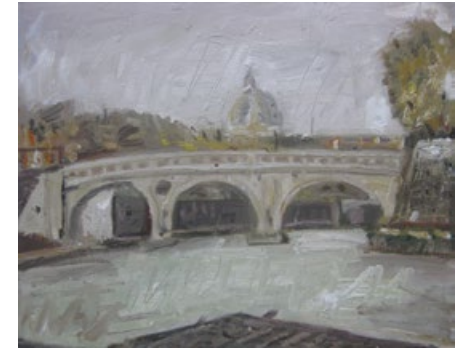
Tiber River study, Rome, 2015, oil on board, 24 x 30cm