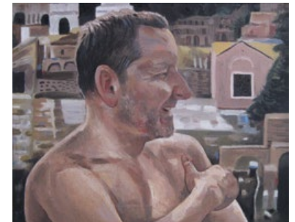
Votive portrait study - Rome , 2016, oil on canvas on board, 27 x 20cm