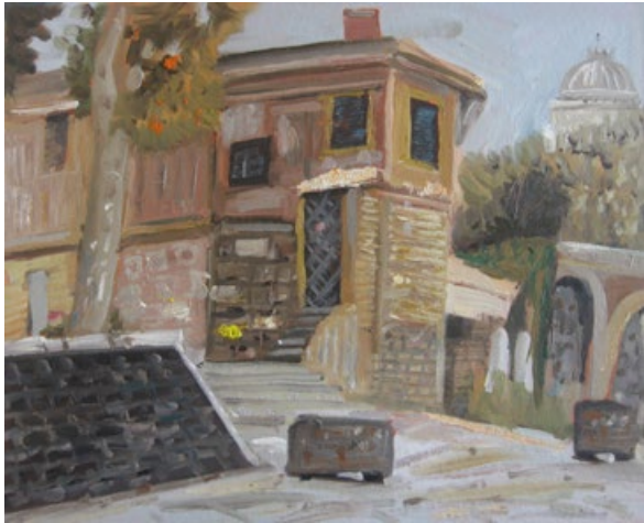
Poet's House, Tiber, Rome, 2015, oil on board, 32 x 40cm