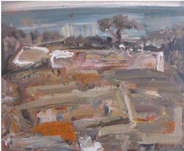
Fortress Savona, 2015, oil on board, 27 x 34cm