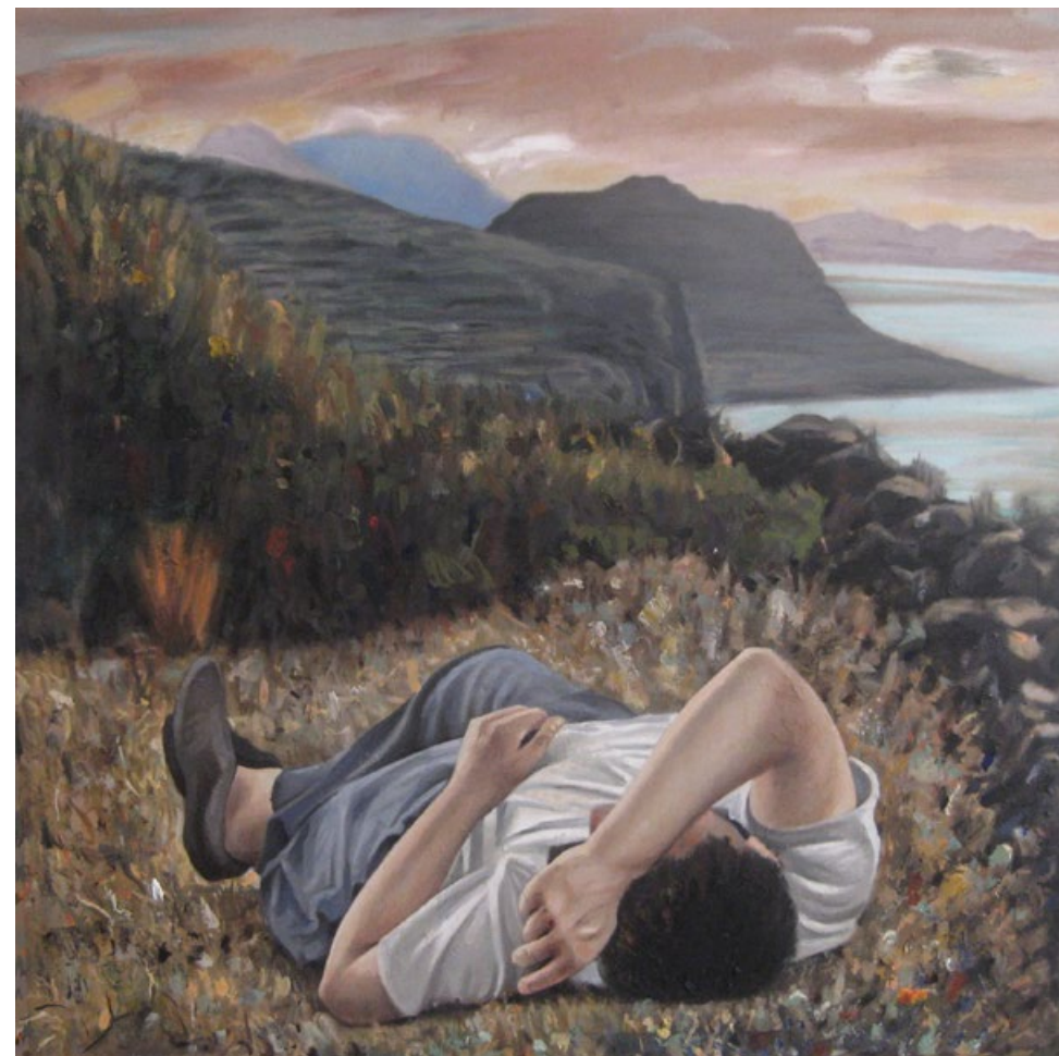
Votive landscape & figure , 2016, oil on canvas, 100 x 100cm