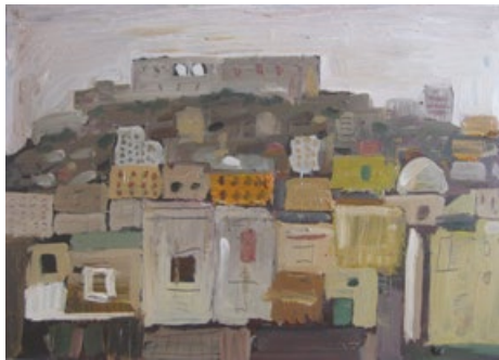
Certosa , 2015, oil on board, 30 x 45cm