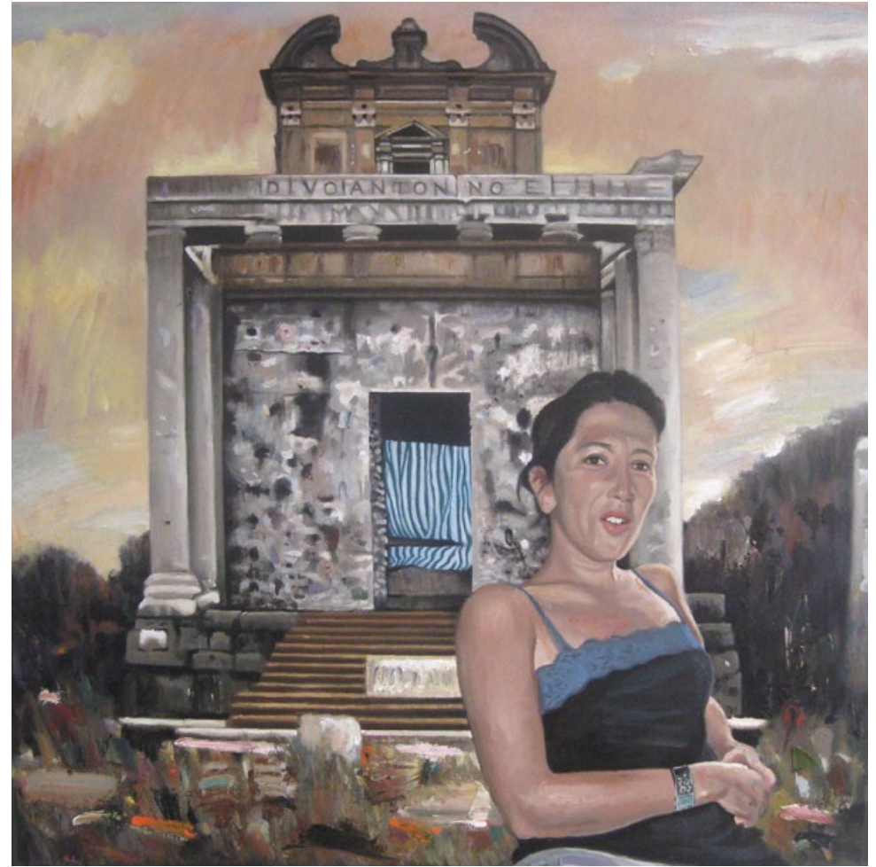
Temple of Faustina , 2016, oil on canvas, 100 x 100cm