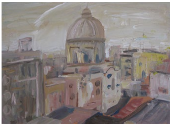
Naples dome, 2015, oil on board, 30 x 36cm