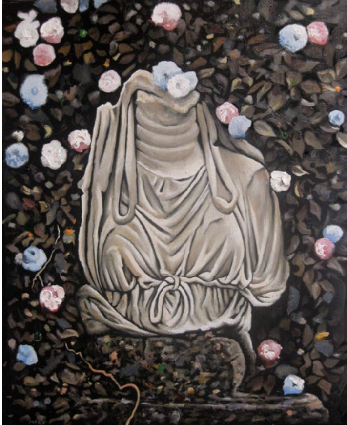
Votive still life , 2016, oil on board, 60 x 40cm