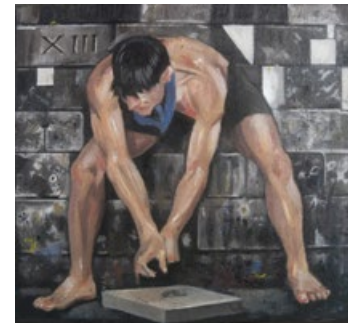
Street figure - Rome , 2016, oil on board, 20 x 20cm