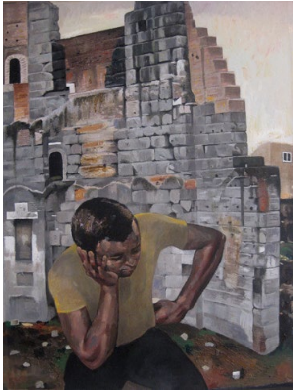
Structure, figure, Rome , 2016, oil on board, 80 x 60cm