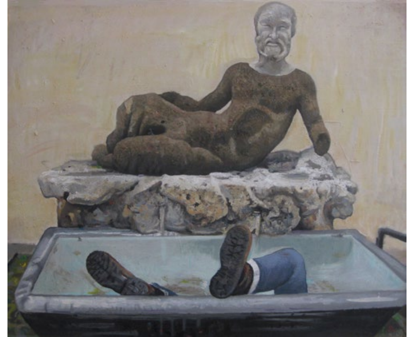
While we sleep , 2016, oil on board, 40 x 60cm