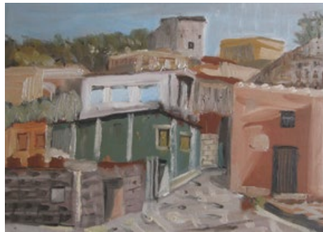
Sanita , 2015, oil on board, 24 x 36cm