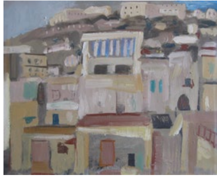
Naples flat study , 2015, oil on board, 26 x 35cm